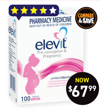
ELEVIT^ Pre-Conception & Pregnancy Multivitamin 100 Tablets